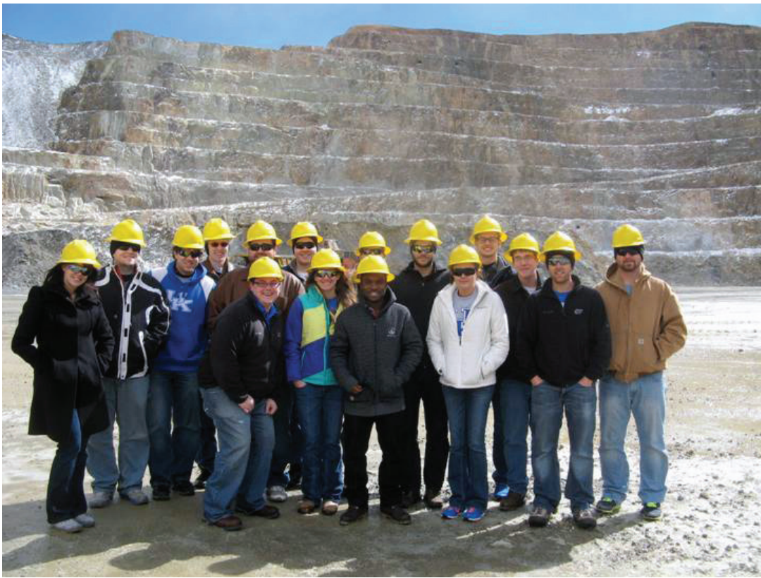
Students visiting the Cripple Creek Gold Mine.