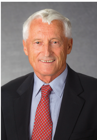
Retirement Dinner April 5, 2014